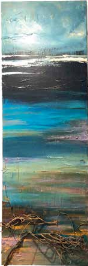
Tide by Suzie Goumas