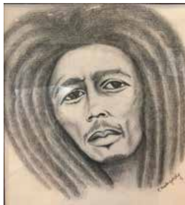
Bob Marley